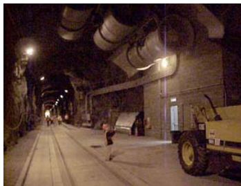
Jet fans inside the tunnel

tunnel, at safe-houses 1 and 8, you may encounter wind turbulence from the jet fans.