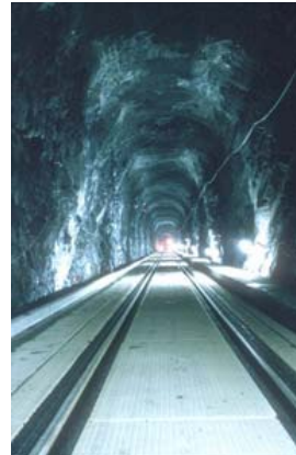
Concrete road surface in tunnel