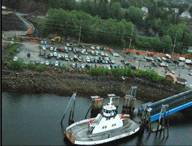
Ketchikan Revilla Ferry Berth & Parking Lot

DOT&PF in cooperation with the Ketchikan Gateway Borough (KGB) intends to construct new ferry berths at both the Revilla & Gravina Airport Shuttle Ferry Facilities, and construct associated upland improvements to enhance the reliability, function & comfort of vehicle and pedestrian traffic to and from the Ketchikan Airport.