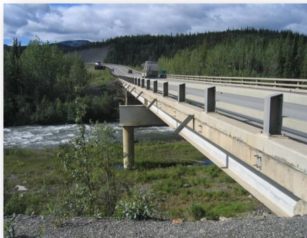
Parks Highway (southbound) – Riley Creek Bridge

While an exclusive northbound left-turn lane at the Parks Highway/Denali National Park Road intersection would separate turning traffic from the high-speed through traffic, constructing the turn lane would likely be a challenge due to the close proximity of the Riley Creek Bridge. In addition to widening the Parks Highway to accommodate a three-lane cross section, widening of the existing bridge structure would be needed. Because the historical crash data at this location