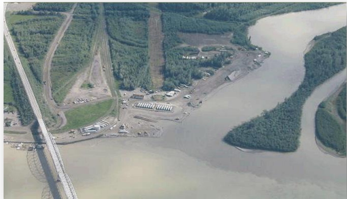
Aerial view of Nenana River harbor

The City of Nenana is currently in preliminary design for a sheet pile shore protection project on the Nenana River side of the harbor. There is a section of bank north of the proposed sheet pile area that needs to be stabilized. There is also a need for a new marine dock area to get boats out of the water.