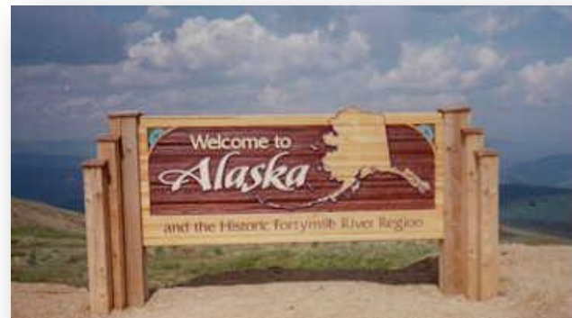
Welcome sign near the Canadian Border along the Top of the World Highway

The Top of the World Highway begins at its intersection with the Taylor Highway at Jack Wade Junction and extends east to the US/Canada Border (approximately 14 miles).