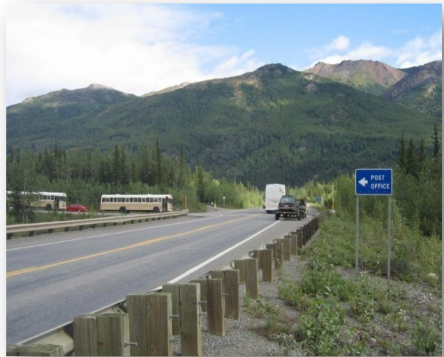
Parks Highway (northbound) - McKinley Village Main

Another special interest area on the Parks Highway is the access point for McKinley Village and the Grizzly Bear Cabins and Campground, located approximately six miles south of the Denali National Park entrance. McKinley Village and the Grizzly Bear Campground are lodging facilities that also provide many outdoor recreational activities such as hiking, rafting, and bicycling. Access is provided along the Parks Highway via a single driveway located immediately south of the Nenana River crossing. Although a review of the crash data in this area revealed no apparent crash trends or patterns, this area has been identified for further review due to a combination of roadway grade, curvature, travel speeds, and type of vehicles entering/exiting the Parks Highway. Because the driveway is located at a sag point of the highway on a slight curve with a posted speed of 55 mph, there is concern about vehicles, particularly heavy vehicles (i.e. tour buses, recreational vehicles, and tractor trailers),