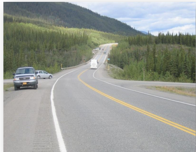
Parks Highway (northbound) – Denali Park Entrance