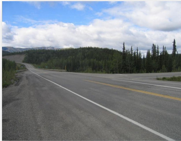
Parks Highway (southbound) – Denali Park Entrance and Riley Creek Bridge

The entrance to the Denali National Park and Preserve is located along a relatively flat section of the Parks Highway, approximately 400 feet north of the Riley Creek Bridge. At this location the Parks Highway consists of a two-lane cross section with a dedicated southbound right-turn lane, varying shoulders, and a posted speed of 55 mph. During the summer months, the park entrance experiences its heaviest demand of traffic, particularly tour vans and trucks. This location is a safety concern because of the lack of an exclusive left-turn lane along the Parks Highway to provide refuge for northbound left-turning vehicles. Although shoulder width does exist for vehicles to slowly pass short standing-vehicle queues, this maneuver is not ideal or recommended.